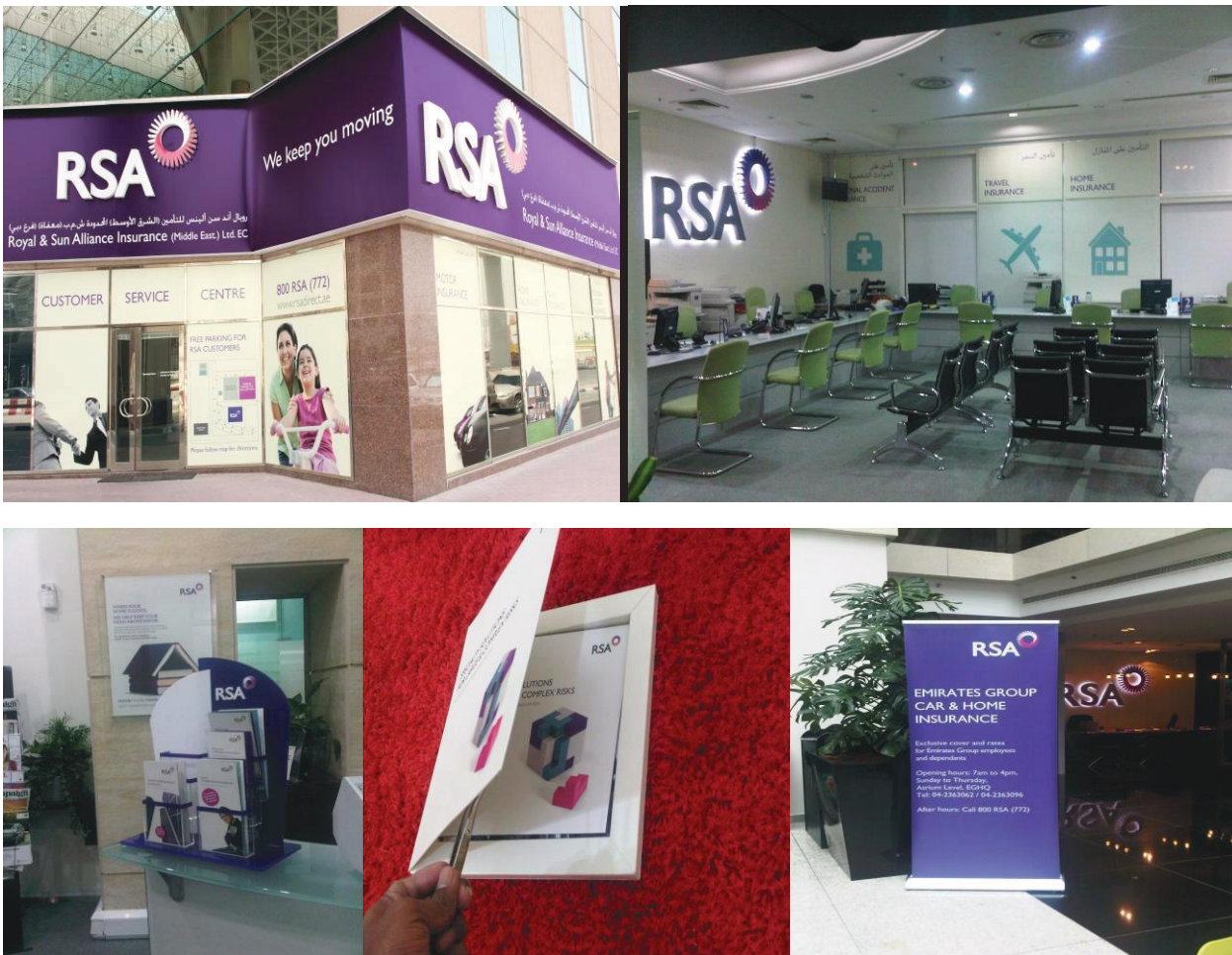
Pictures shown above: RSA window branding (light boxes) , RSA interiors , RSA acrylic stands , RSA Singapore brochures , RSA DNATA branding.

RSA Insurance have been working with Ahmed for our below the line printing and production requirements. I have found them to be an efficient, competent and prompt service provider. All aspects of their services are spot on - there has never been anything that they haven't resolved immediately and their employees are quick to respond, knowledgeable and professional."