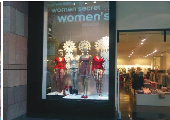
Pictures shown above: Retail Branding: Dangers, wobblers, shop decorations, banners, window displays etc