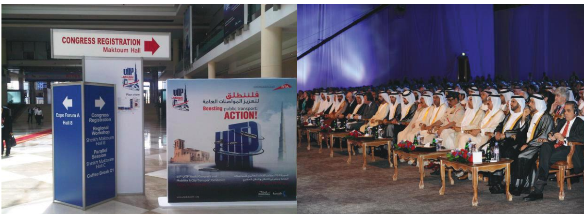
Pictures shown above: 59 th world transport and mobility congress event collaterals.